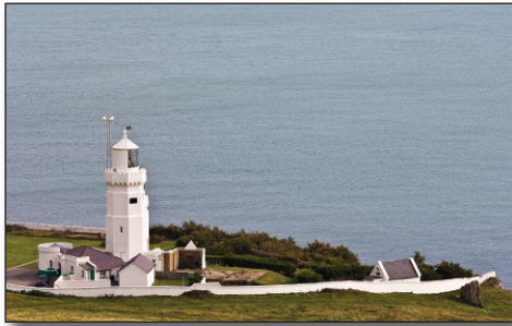
The lighthouse at St Catherine's Point at the southern tip of the island.