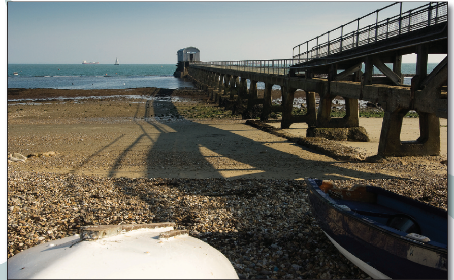
The lifeboat station jutting out into the sea at Bembridge.