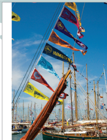
Left: Pennant flags on the stays of a classic yacht moored in Yarmouth harbour for the Old Gullies regatta. The Old Gullies regatta shows yachts from far and wide and usually runs annually.