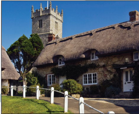
The view to All Saints' Church at Godshill with the famous thatched cottages surrounding the green in the foreground.