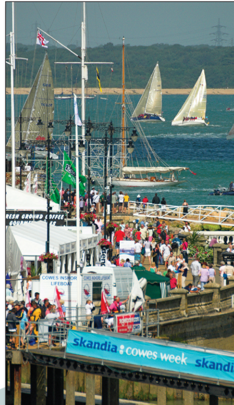
The busy quayside during Cowes Week with sailing yachts racing in the background.