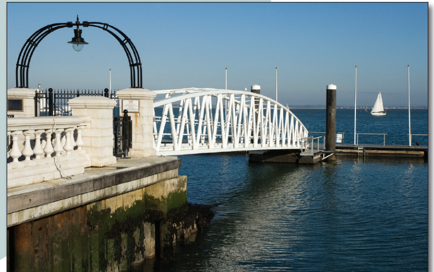
The landing stage for royalty in front of the Royal Yacht Squadron at the entrance to Cowes harbour.